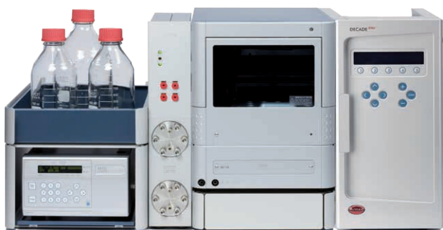
Figure 1: ALEXYS Kanamycin and Amikacin Analyzer

Kanamycin and amikacin are closely related, water soluble, broad spectrum aminoglycoside antibiotics. Kanamycin is obtained from Streptomyces kanamyceticus . Amikacin is synthesised by acylation of an amino group of kanamycin A with L(-)-g- amino- \alpha - hydroxybutyric acid (LHABA). Both antibiotics can be analysed using ionexchange chromatography in combination with pulsed amperometric detection [1-4].