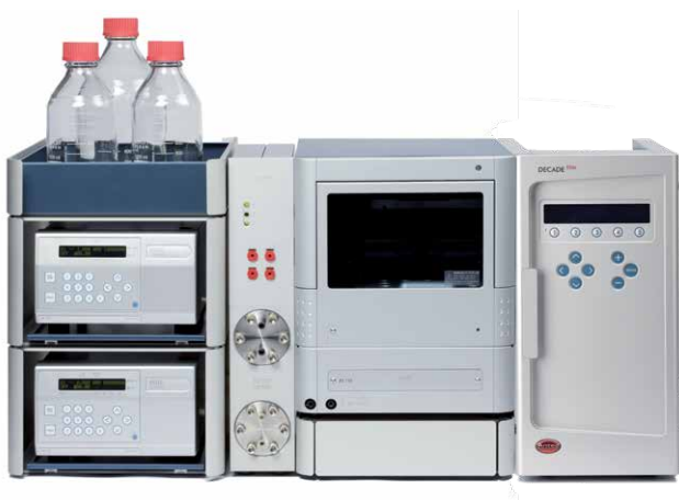
Figure 1: ALEXYS Aminoglycosides Analyzer.

The analysis of the byproduct contribution in bulk tobramycin and preparations is important as to insight in stability, quality control and authenticity. A number of qualitative and quantitative methods has been published so far [1] but the focus is mainly on tobramycin and not on the by-products. Because of the presence of sugar groups in both tobramycin and by-products LC with pulsed amperometric detection (PAD) is a highly selective and sensitive analytical tool [2].