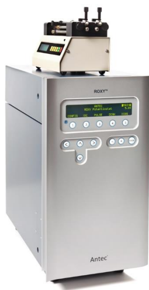
Fig. 1. ROXY EC system (ROXY potentiostat with stacked syringe pump).

To assure an efficient and successful onsite installation of the ROXY EC system by engineers of Antec or its distributors, we have written this guideline with pre-installation requirements. This document contains hardware and site requirements as well as information about chemicals required for installation and performance qualification of the ROXY EC system (p/n 210.007x). It is the customer's responsibility that all the pre-installation requirements are met and all chemicals are available onsite on the day of installation.