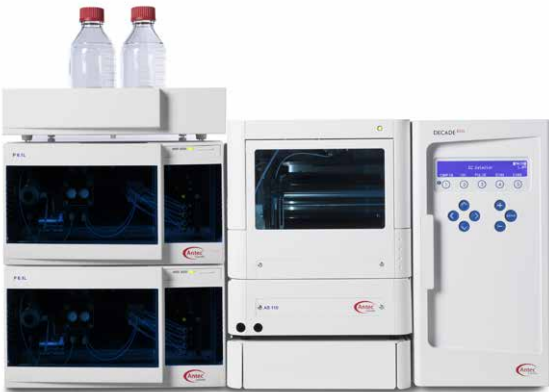
Figure 1: ALEXYS Aminoglycosides Analyzer for Spectinomycin.

Spectinomycin is an aminoglycoside-like antibiotic produced by Streptomyces spectabilis . In solution, spectinomycin will undergo a ring opening and closing of the hemiketal function, resulting in an equilibrium mixture of four possible anomers. Hydrolysis with acid produces actinamine and in basic solutions actinospectinoic acid (ASA) is formed. Important fermentation impurities are dihydrospectinomycin and dihydroxyspectinomycin [1, 2]. Because of the presence of glycoside groups in Spectinomycin and by-products, LC with pulsed amperometric detection (PAD) has been applied for analysis [3]. Conditions are to a large extent in correspondence with the EP requirements [4,5].