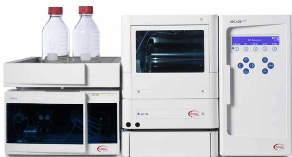
Figure 1: ALEXYS Kanamycin and Amikacin Analyzer

Kanamycin and amikacin are closely related, water soluble, broad spectrum aminoglycoside antibiotics. Kanamycin is obtained from Streptomyces kanamyceticus . Amikacin is synthesised by acylation of an amino group of kanamycin A with L(-)-g- amino- \alpha - hydroxybutyric acid (LHABA). Both antibiotics can be analysed using ionexchange chromatography in combination with pulsed amperometric detection [1-4].