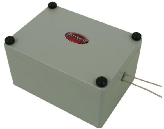
Figure 1. Faraday cage.

Please take the following precautions to assure optimal performance of the product: