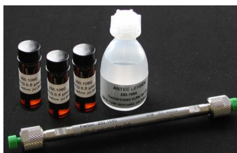
Fig. 1. Part of PQ for HPLC/ECD kit.