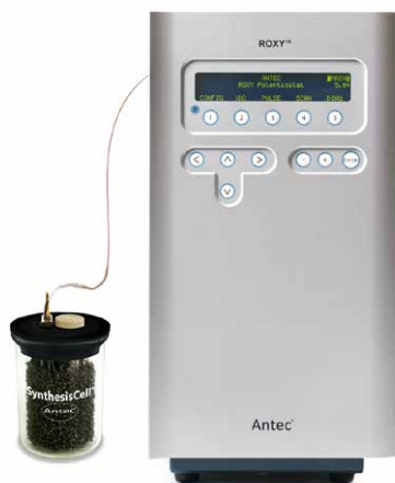
ROXY Potentiostat with 80 mL SynthesisCell