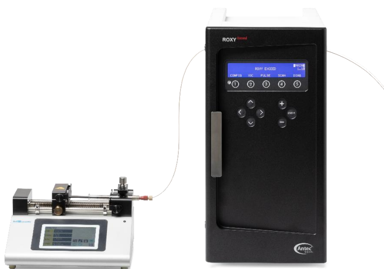
Fig. 1. ROXY Exceed EC system (ROXY Exceed potentiostat) with syringe pump.

To assure an efficient and successful onsite installation of the ROXY Exceed EC system by engineers of Antec Scientific or its distributors, we have written this guideline with pre-installation requirements. This document contains hardware and site requirements as well as information about chemicals required for installation and performance test of the ROXY Exceed EC system. It is the customers responsibility that all the pre-installation requirements are met and all chemicals are available onsite on the day of installation.