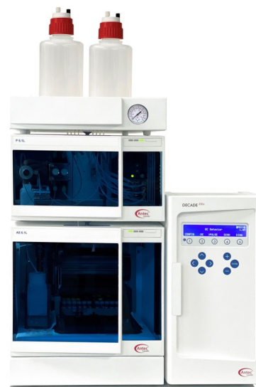
Fig. 2. ALEXYS Carbohydrate Analyzer

* ) Depending on the lab ambient conditions an optional CT 2.1 column thermostat (186.ATC00) may be required to separate at temperatures between 25 - 30°C.