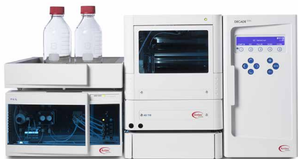
Figure 2: ALEXYS analyzer