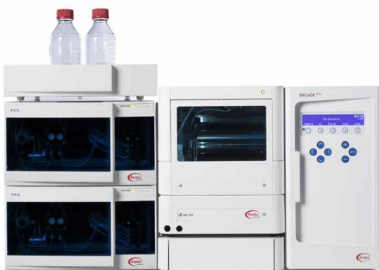
Figure 1: ALEXYS Aminoglycosides Analyzer for Spectinomycin.

Spectinomycin is an aminoglycoside-like antibiotic produced by Streptomyces spectabilis . In solution, spectinomycin will undergo a ring opening and closing of the hemiketal function, resulting in an equilibrium mixture of four possible anomers. Hydrolysis with acid produces actinamine and in basic solutions actinospectinoic acid (ASA) is formed. Important fermentation impurities are dihydrospectinomycin and dihydroxyspectinomycin [1, 2]. Because of the presence of glycoside groups in Spectinomycin and by-products, LC with pulsed amperometric detection (PAD) has been applied for analysis [3]. Conditions are to a large extent in correspondence with the EP requirements [4,5].