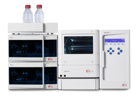
Fig. 1. ALEXYS Analyzer

Chicken blood plasma LNAA content was investigated for a study at the University of Utrecht. The LNAAs were extracted with methanol from the sample together with norleucine as internal standard. After centrifugation, the supernatant was diluted with borate buffer (pH 10.4) to assure efficient pre-column derivatization with OPA. The