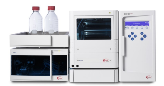
Fig. 1. ALEXYS Analyzer

3-Hydroxykynurenine (3-HK or 3-HKyn) is a metabolite in the kynurenine pathway, the major route of tryptophan degradation in mammals. 3-HK is a potential endogenous neurotoxin whose increased levels have been described in several neurodegenerative disorders [1]. The ALEXYS Neurotransmitter Analyzer is a versatile system for the trace analysis of various neurotransmitters, like catecholamines, serotonin, acetylcholine, GABA, Glu and other amino acids [2-4]. This note shows the proof of principle for the analysis of 3-HK using the ALEXYS Neurotransmitter analyzer.