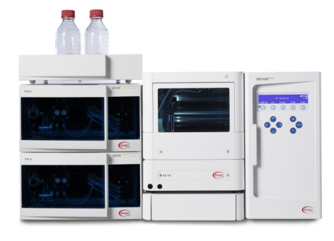
Fig. 1. ALEXYS Analyzer

RBL-2H3 cells (mast cell model) were used for a study at the University of Utrecht. The cells were exposed to DNP-BSA allergen and the release of histamine into the surrounding cell culture was measured. Samples were deproteinized with perchloric acid, followed by centrifugation. The supernatant was collected and the pH was adjusted to pH > 8 using a sodium hydroxide solution to assure efficient pre-