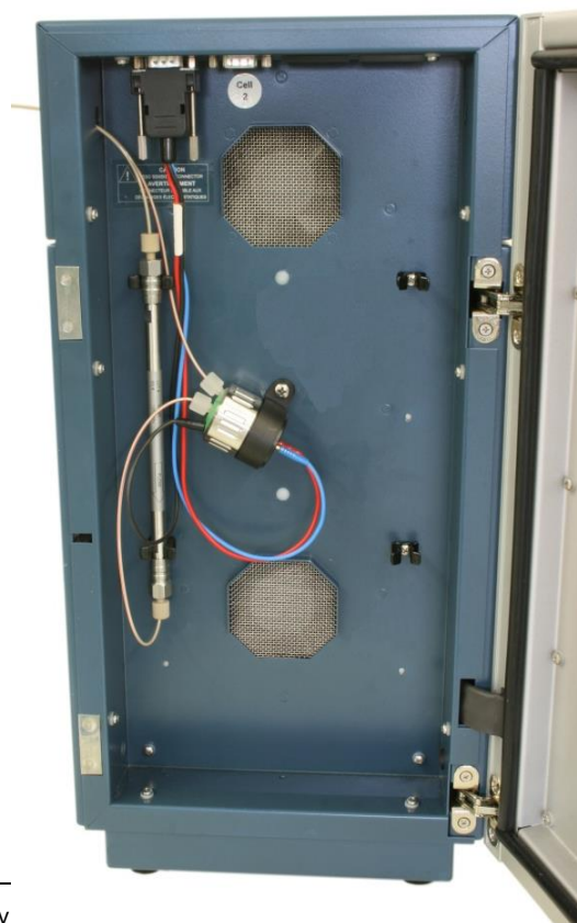
Fig 4. Installation of SenCell in DECADE II detector: photograph of DECADE II oven compartment with column and SenCell installed.

Copyright ©2012 Antec. All rights reserved. Contents of this publication may (including electronic storage and retrieval or translation into a foreign language) without prior agreement and written consent from the copyright of the owner. The information contained in this document is subject to change without notice. The information provided herein is believed to be reliable. Antec shall not be liable for errors contained herein or for incidental or consequential damages in connection with the furnishing, performance, or use of this manual. All use of the hardware shall be entirely at the user's own risk.